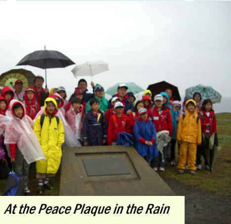
At the Peace Plaque in the Rain

In Japan, most galleries are located in big cities. But Mendocino County has many galleries even in less-populated towns. In Mendocino art is popular, people are talkative and liberal. Sea, woods, flowers, houses, every place I went around I thought would be perfect for a picture.