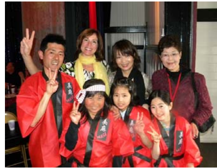
Homestay Group with Friends at the See-You-Again Dinner