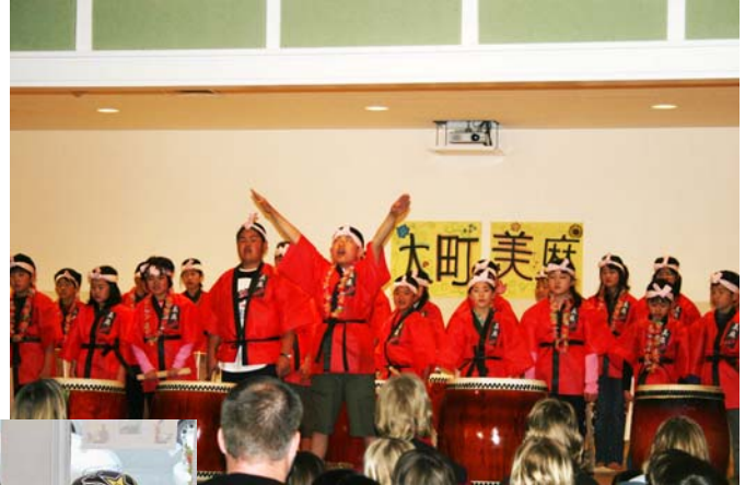
Taiko Performance at the Mendocino K-8 School