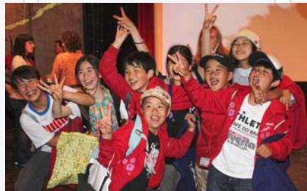
Having a Great Time at the See -You -Again Dinner