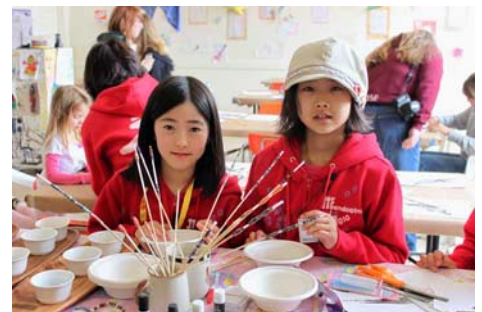
At the Mendocino Recreation Center