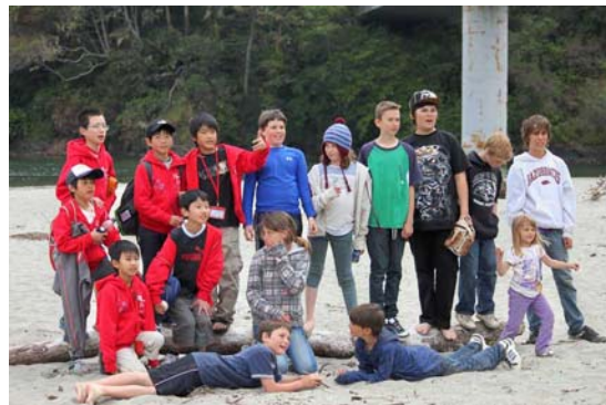
Group at the Beach on the "Free Day"