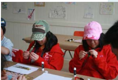
Visiting Students doing Crafts at the Mendocino Recreation Center

nation and homogeneous nation. "Why is art so popular in Mendocino?" is my first question.