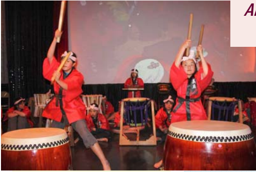
Miasa Students Taiko Performance at the See-You-Again Dinner