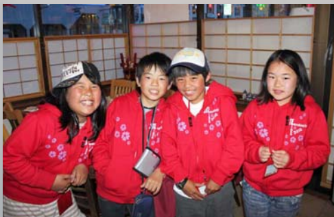
Having Fun at the Sushi Restaurant