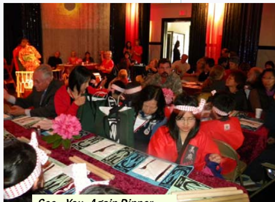
See -You -Again Dinner

Sunday was the much anticipated "Free Day" when the homestay hosts were able to show their guests around Mendocino and partake of the many splendors of the area.