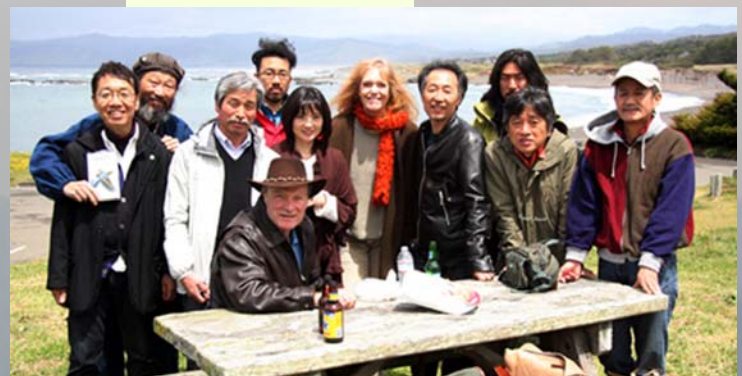
Artist Group at MacKerricher Beach

For more pictures and detailed accounts of both group visits, go to http://www.mendosca.org/html/2010.html on the internet!