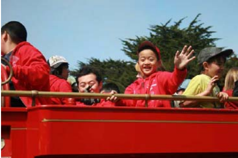
A Ride on the Fire Truck