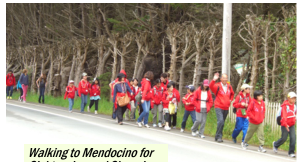
Walking to Mendocino for Sightseeing and Shopping